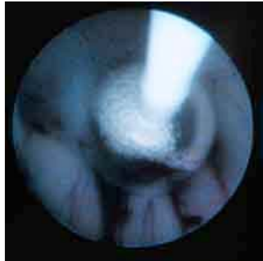
Figure 5. In the photograph on the left, a balloon-tipped catheter has been advanced through the endoscope into the third ventricle to enlarge the hole in the floor.