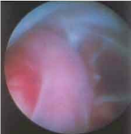
Figure 6b. The tip of the endoscope has now been advanced through the opening in the floor, and one of the large arteries at the base of the skull, the basilar artery, is visible.

Although the risks attached to third ventriculostomy are greater than the risks of a single CSF shunt operation, and although success is not assured, it is still a good choice for