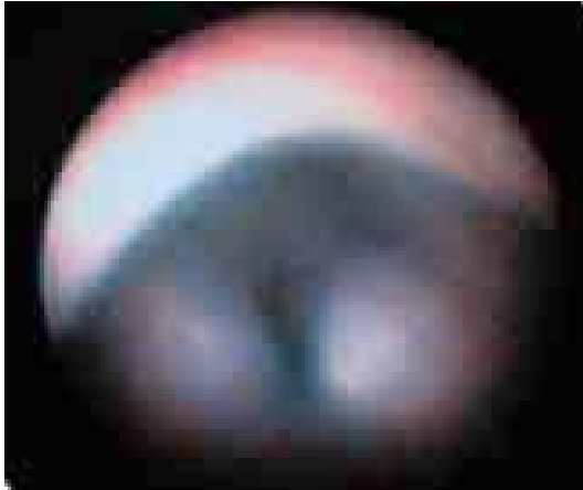
Figure 2. The tip of the endoscope lies in the lateral ventricle, and through the foramen of Monroe, the paired mammillary bodies in the floor of the third ventricle are coming into view. The view is oriented as though the patient's nose is upward.

meningitis. Logically, hydrocephalus caused by tumors arising in or around the fourth ventricle should respond readily to third ventriculostomy, and experience has shown that many cases of hydrocephalus related to spina bifida can be managed successfully, especially in older children and adults as an alternative to CSF shunt revision. In selected patients the success rate of third ventriculostomy is about 70%.