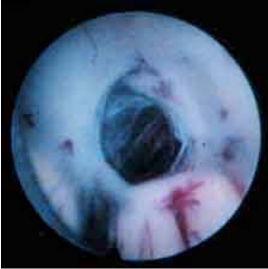
Figure 6a. The opening from the third ventricle into the subarachnoid spaces at the base of the brain allows CSF to drain directly from the ventricular system into the cisterns outside the brain. Small arterial branches of the basilar artery are faintly visible through the opening.